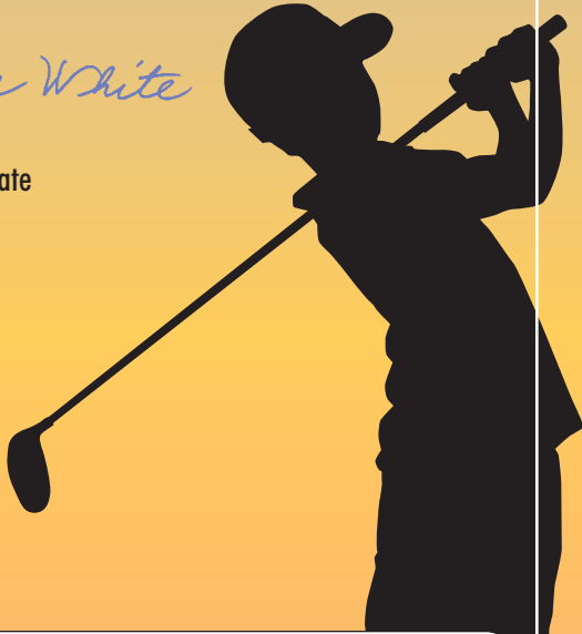
Jesse White Secretary of State